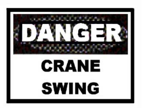
Warning Label Part No. 101049